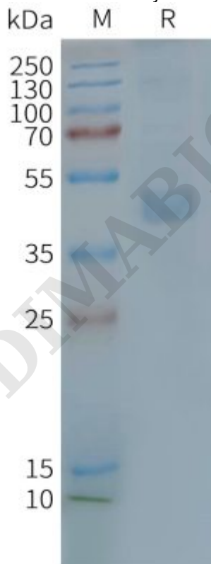
Figure2. Human CX3CR1-Nanodisc, Flag Tag on SDS-PAGE