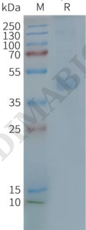
Figure2. Human CX3CR1-Nanodisc, Flag Tag on SDS-PAGE