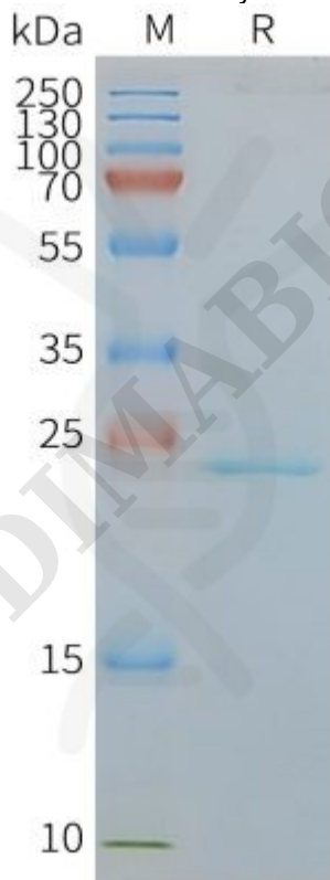
Figure2. Human CMTM6-Nanodisc, Flag Tag on SDS-PAGE