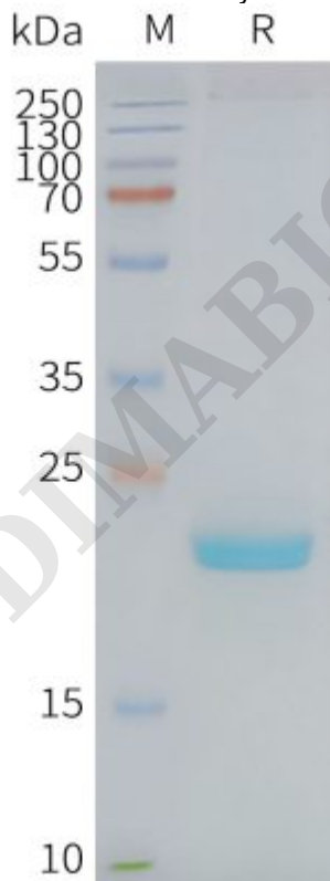
Figure2. Human CLDN4-Nanodisc, Flag Tag on SDS-PAGE