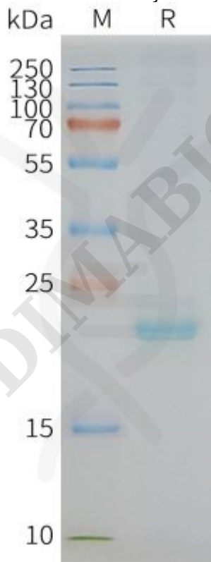
Figure2. Human CLDN3-Nanodisc, Flag Tag on SDS-PAGE