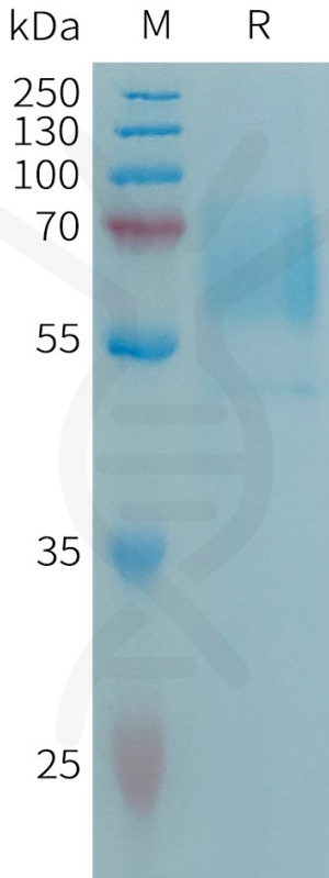
Figure 1. Human CD98 Protein, His Tag on SDS-PAGE under reducing condition.