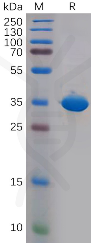
Figure 1. Human CD81 Protein, hFc Tag on SDS-PAGE under reducing condition.