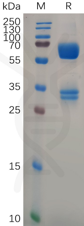
Figure 1. Human CD74(73-296) Protein, hFc Tag on SDS-PAGE under reducing condition.