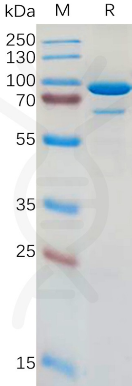
Figure 1. Human CD73 Protein, hFc Tag on SDS-PAGE under reducing condition.