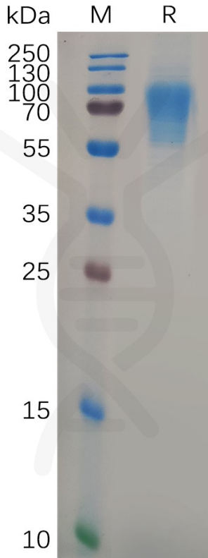
Figure 1. Human CD6 Protein, His Tag on SDS-PAGE under reducing condition.