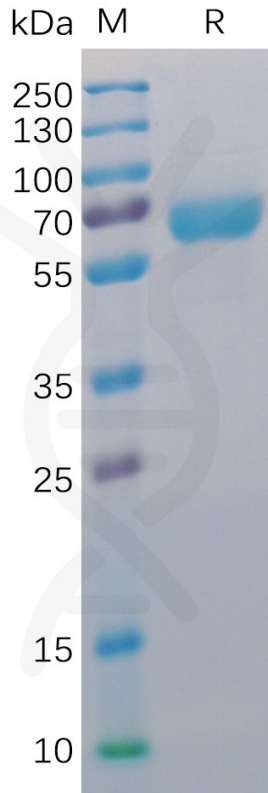
Figure 1. Human CD48 Protein, mFc-His Tag on SDS-PAGE under reducing condition.