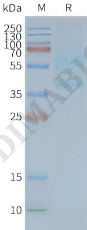
Figure2. Human CD47-Nanodisc, Flag Tag on SDS-PAGE