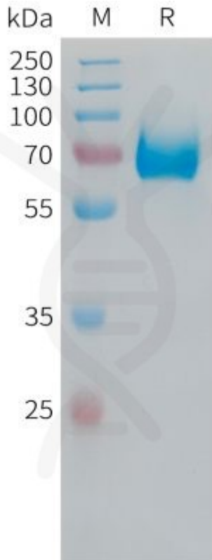
Figure 1. Human CD38, hFc Tag on SDS-PAGE under reducing condition.