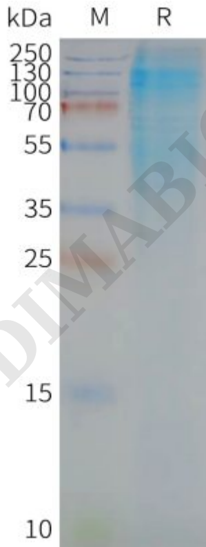
Figure2. Human CD37-Nanodisc, Flag Tag on SDS-PAGE