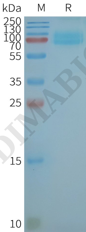
Figure 2. Human CD36-Nanodisc, Flag Tag on SDS-PAGE