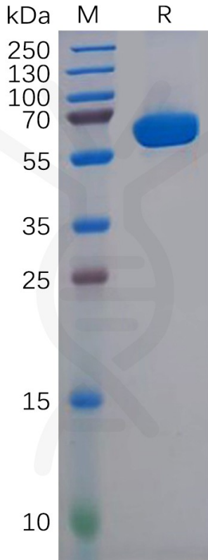
Figure 1. Human CD2 Protein, hFc Tag on SDS-PAGE under reducing condition.