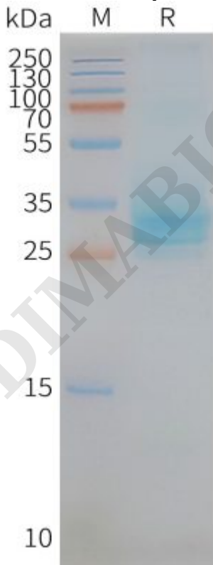
Figure2. Human CD151-Nanodisc, Flag Tag on SDS-PAGE