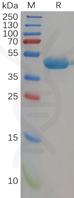
Figure 1. Human CD112 Protein, His Tag on SDS-PAGE under reducing condition.