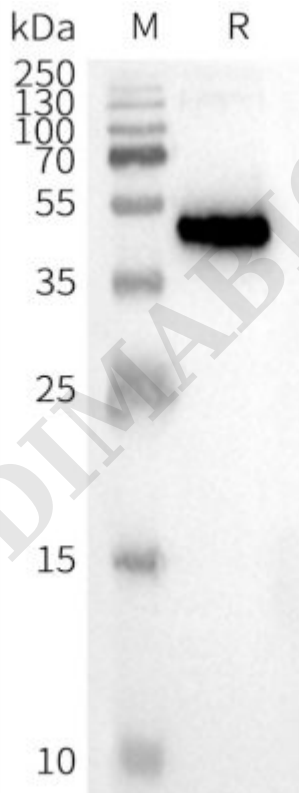
Figure2. WB analysis of Human CCR8-Nanodisc with anti-CCR8 monoclonal antibody (BME100115) at 1 \mu g/ml, followed by Goat Anti-Human IgG HRP at 1/5000 dilution