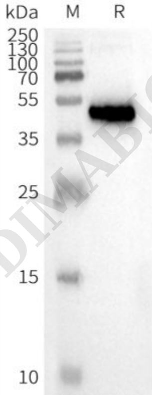
Figure2. WB analysis of Human CCR8-Nanodisc with anti-CCR8 monoclonal antibody (BME100115) at 1µg/ml, followed by Goat Anti-Human IgG HRP at 1/5000 dilution