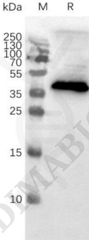
Figure 2. Western blot of CCR8 MNPs

D. CCR8 full length membrane nanoparticles samples were stained with anti-CCR8 antibody (BME100063) at 2 \mu\text{g}/\text{mL} , followed by Goat anti-human IgG 488 secondary antibody.