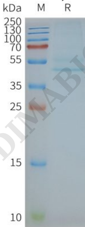
Figure2. Human CCR3-Nanodisc, Flag Tag on SDS-PAGE