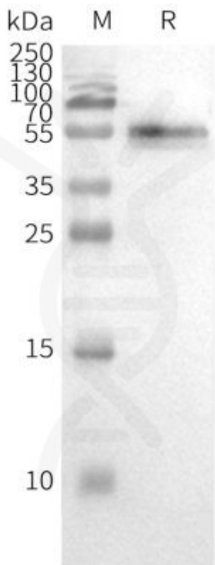
Figure3. WB analysis of Human CCR2-Nanodisc with anti-CCR2 monoclonal antibody (BME100087), followed by Goat Anti-Human IgG HRP at 1/5000 dilution