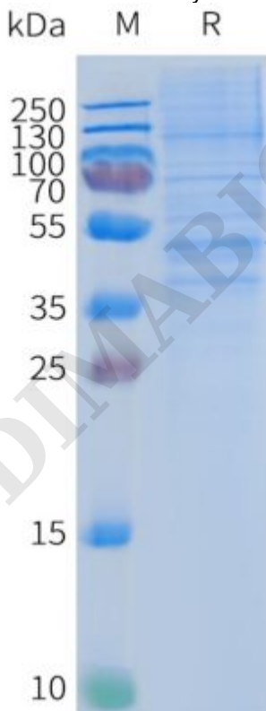
Figure2. Human CCR2-Nanodisc, Flag Tag on SDS-PAGE