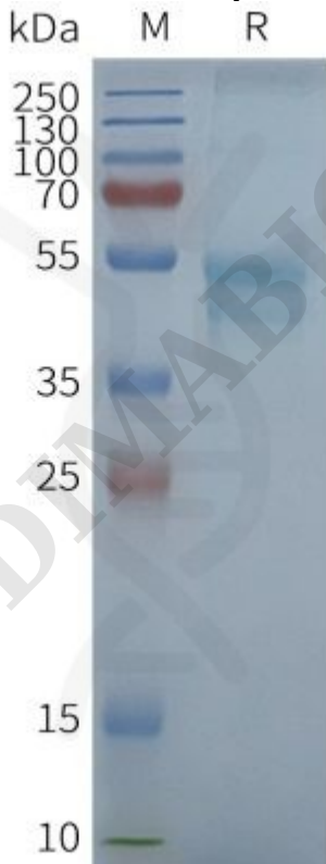
Figure2. Human CCR1-Nanodisc, Flag Tag on SDS-PAGE