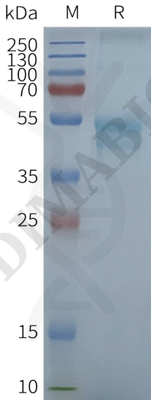
Figure 2. Human CCR1-Nanodisc, Flag Tag on SDS-PAGE