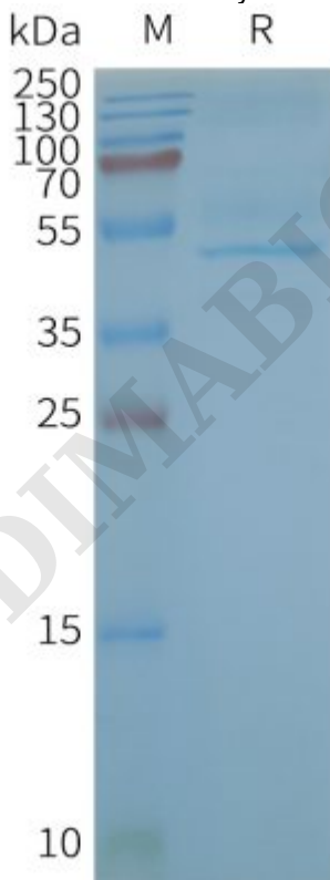
Figure2. Human CB2-Nanodisc, Flag Tag on SDS-PAGE