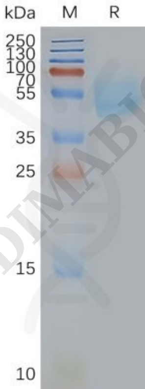
Figure2. Human ADORA2A-Nanodisc, Flag Tag on SDS-PAGE