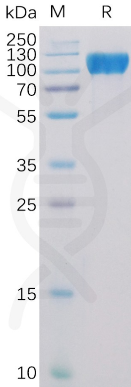
Figure 1. Human ACE2 Protein, His Tag on SDS-PAGE under reducing condition.