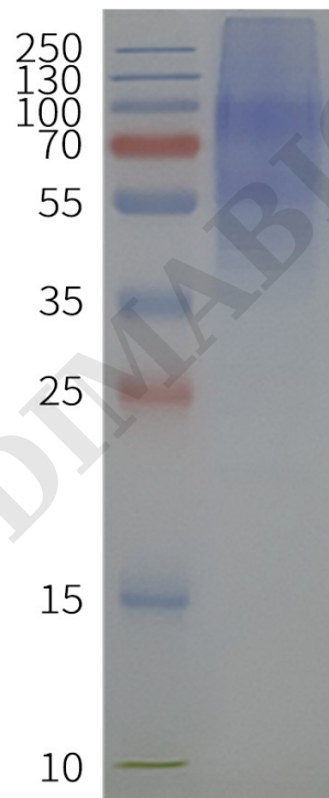
Figure 2. Human 5HT2C-Strep-Nanodisc, C-Flag&Strep Tag on SDS-PAGE