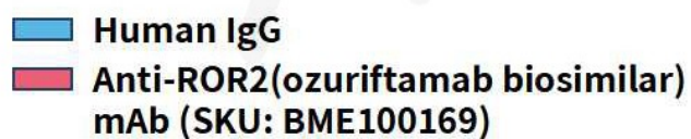
Figure 1. Flow cytometry analysis of human ROR2 overexpression using Hu_ROR2 CHO-S Cell Line (Cat. No. CEL100044) and Anti-ROR2(ozuriftamab biosimilar) mAb (Cat. No. BME100169)