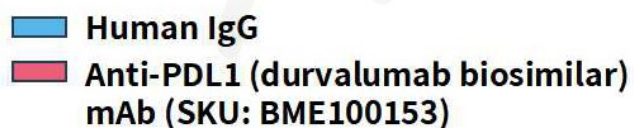
Figure 1. Flow cytometry analysis of human PD-L1 overexpression using Hu_PD-L1 K562 Cell Line (Cat. No. CEL100022) and Anti-PDL1 (durvalumab biosimilar) mAb (Cat. No. BME100153)