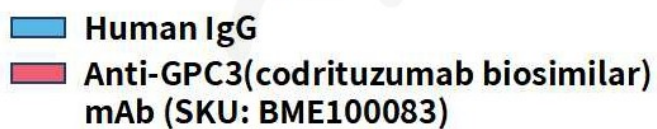
Figure 1. Flow cytometry analysis of human GPC3 overexpression using Hu_GPC3 K562 Cell Line (Cat. No. CEL100084) and Anti-GPC3(codrituzumab biosimilar) mAb (Cat. No. BME100083)