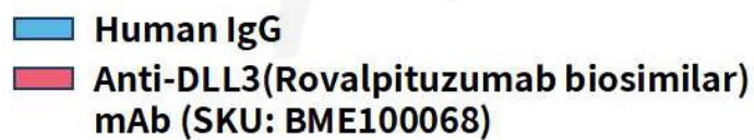
Figure 1. Flow cytometry analysis of human DLL3 overexpression using Hu_DLL3 CHO-S Cell Line (Cat. No. CEL100038) and Anti-DLL3(Rovalpituzumab biosimilar) mAb (Cat. No. BME100068)