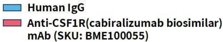
Figure 1. Flow cytometry analysis of human CSF1R overexpression using Hu_CSF1R K562 Cell Line (Cat. No. CEL100014) and Anti-CSF1R(cabiralizumab biosimilar) mAb (Cat. No. BME100055)