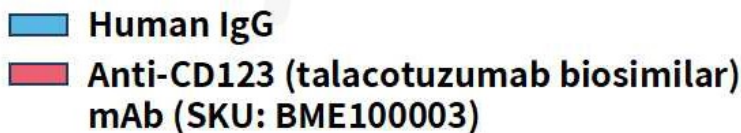
Figure 1. Flow cytometry analysis of human CD123 overexpression using Hu_CD123 K562 Cell Line (Cat. No. CEL100011) and Anti-CD123 (talacotuzumab biosimilar) mAb (Cat. No. BME100003)