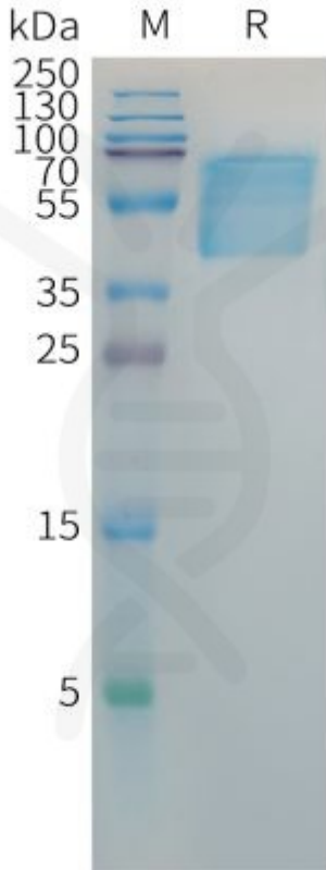
Figure 1. Hepatitis B virus HBSAG Protein, hFc Tag on SDS-PAGE under reducing condition.