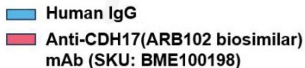
Figure 1. Flow cytometry analysis of human CDH17 overexpression using Hu_CDH17 K562 Cell Line (Cat. No. CEL100009) and Anti-CDH17(ARB102 biosimilar) mAb (Cat. No. BME100198)