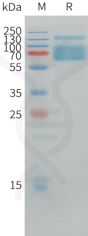
Figure 1. Canine PD-L1 Protein, hFc Tag on SDS-PAGE under reducing condition.