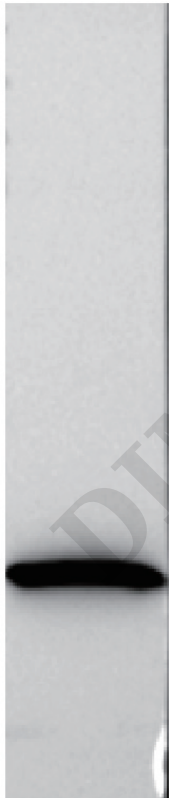
Figure 2. Anti-UCHL1 antibody (SKU# DME100843) at 1/1000 dilution

250 kDa- 130 kDa- 100 kDa- 70 kDa- 55 kDa- 35 kDa- 25 kDa- 15 kDa-