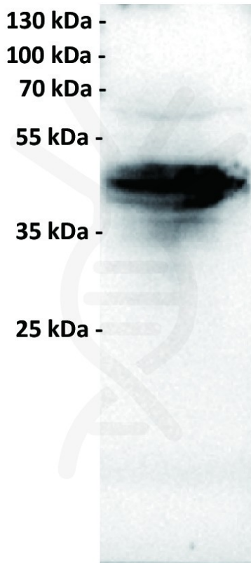
Figure 1. Anti-FOLR1 antibody (SKU# DMC100585) at 1/1000 dilution

Lane : HeLa (human cervical adenocarcinoma epithelial cell), whole cell lysate